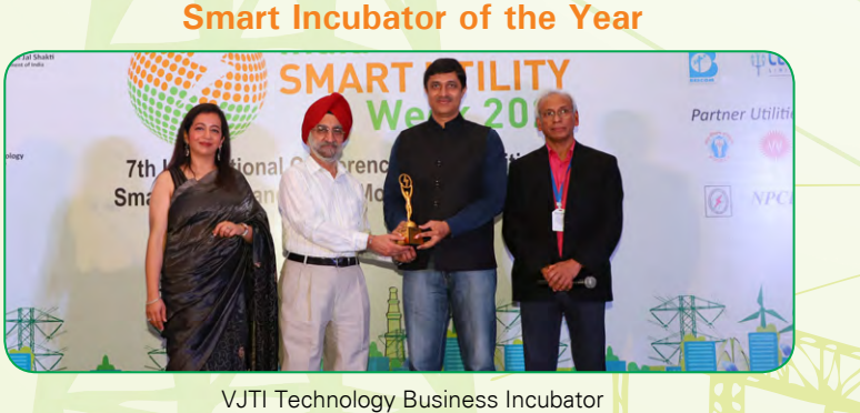
VJTI Technology Business Incubato

Best Survival Effort, Business Continuity and Innovation during Crisis Periods (COVID-19/ Natural Calamity) – Utility