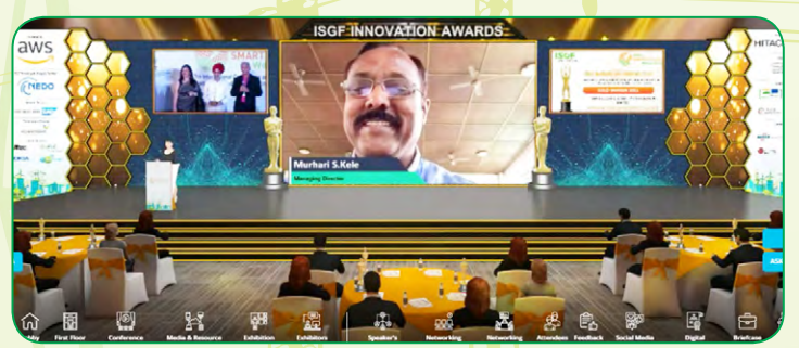
Tripura State Electricity Corporation Limited Gold Award