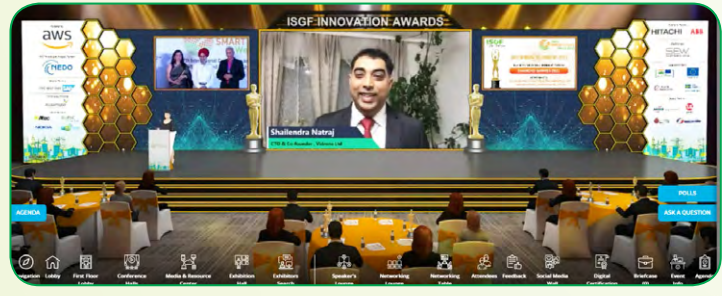
Vidrona Limited Diamond Award