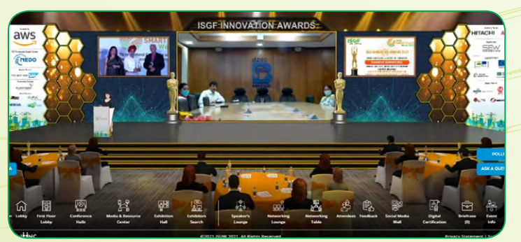
Bangalore Electricity Supply Company Limited Diamond Award