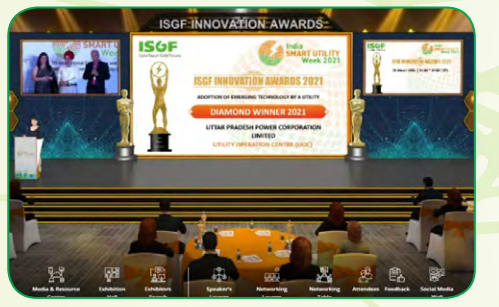
Uttar Pradesh Power Corporation Limited Diamond Award