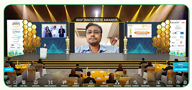
The Tata Power Company Limited Platinum Award