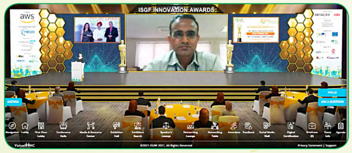
Paschim Gujarat Vij Company Limited Gold Award

Supporting Measures for Rooftop by DISCOM