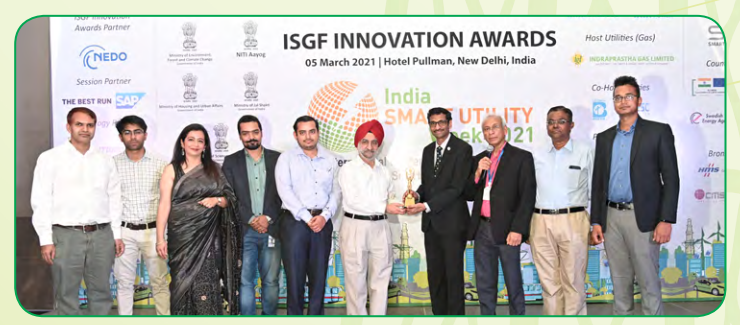
Power System Operation Corporation Ltd Diamond Award

Best Survival Effort, Business Continuity and Innovation during Crisis Periods (COVID-19/ Natural Calamity) – Utility