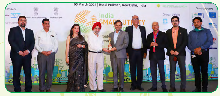
BSES Rajdhani Power Limited Gold Award